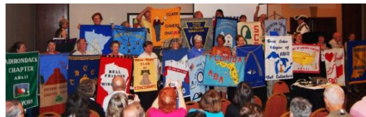
Parade of Banners